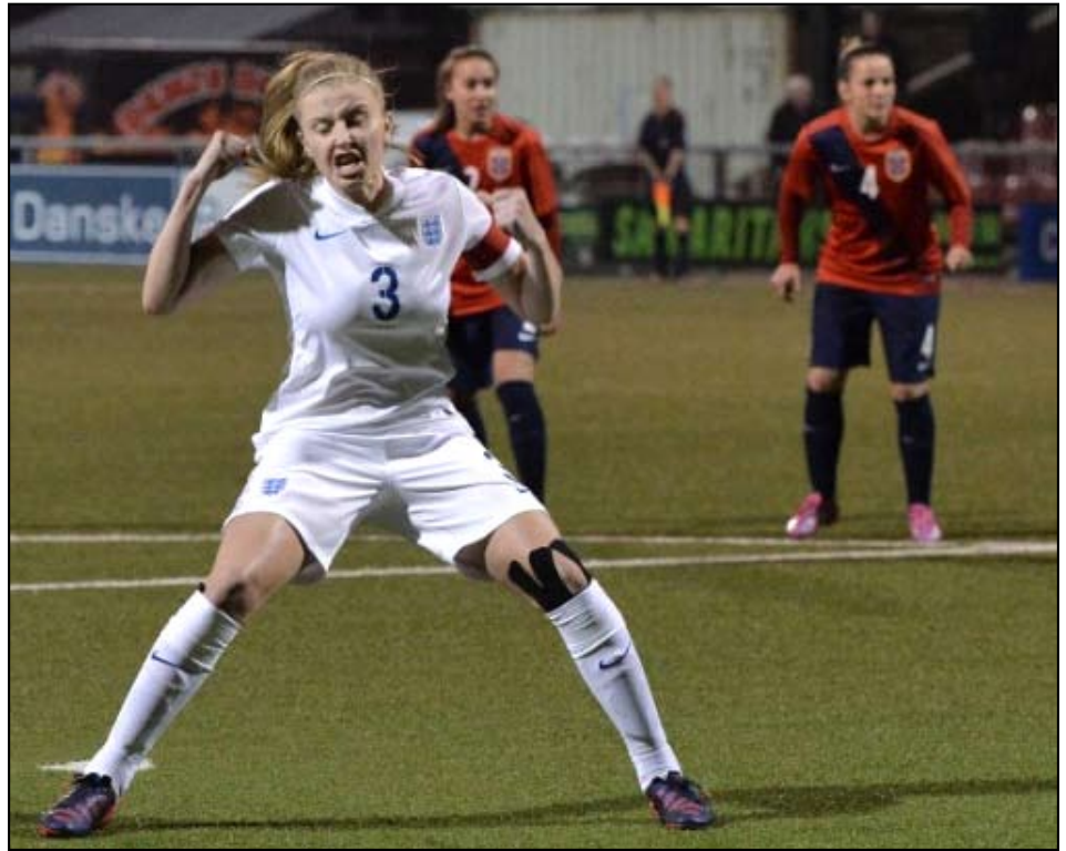
Though England's Nr 3 encroached at the whistle, by the time the kick was taken, she nearly made it back the penalty area.

In the end both teams had qualified for the finals with 7 points each.