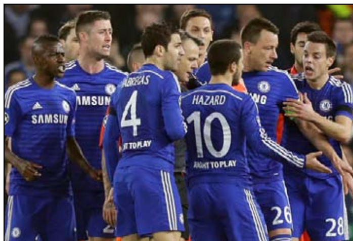
The Chelsea players made a vociferous protest to the referee Bjorn Kuipers, center, who issued a red card to P.S.G.'s Zlatan Ibrahimovic.

As in Munich, the players' intentions were clear. They wanted the other team's player, Ibrahimovic, to be ordered off. The una-